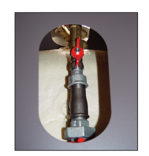
Fig. B (rear panel)